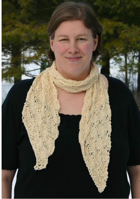
model Natalie Servant

This pattern is my attempt to create a scarf I thought I saw when I was shopping. From across the store I saw a slightly ruched scarf on the bias that draped in a wonderful way. When I examined it, it had just been hung up badly. The image of the scarf I thought I had seen stuck with me and I wanted to use yarn to reproduce it.