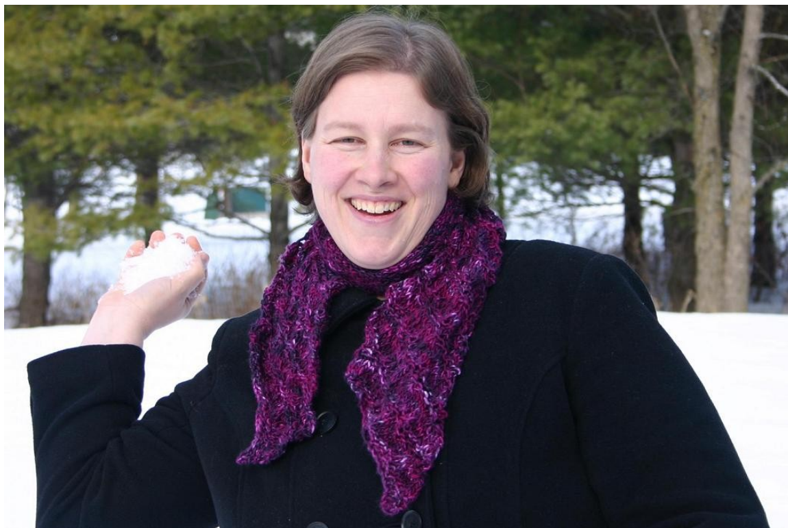
model Natalie Servant